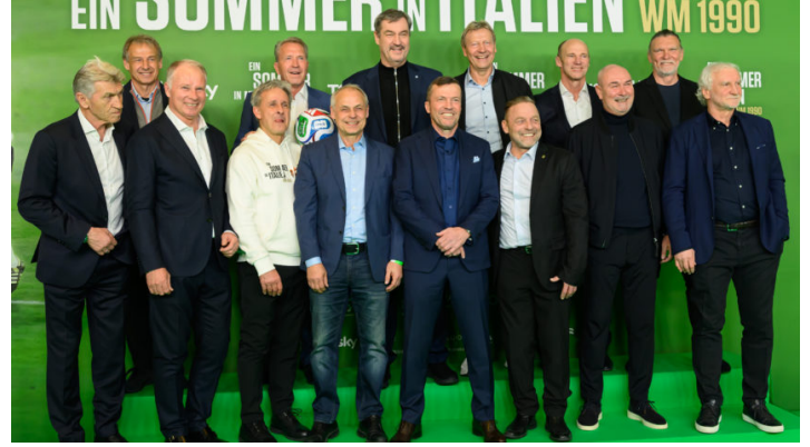
On 16 March 2026, Minister-President Dr Markus Söder attended the cinema premiere of ‘A Summer in Italy – World Cup 1990’ in Munich.