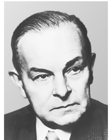
Dr. h. c. Max Streibl