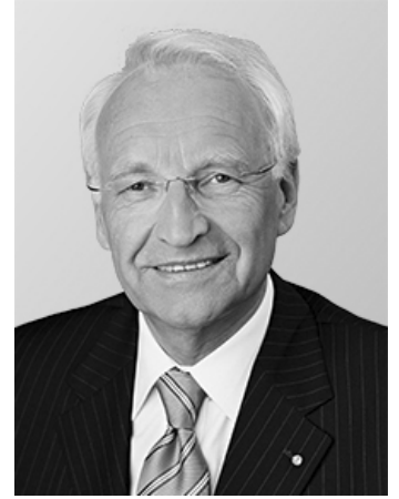
Dr. Markus Söder, MdL