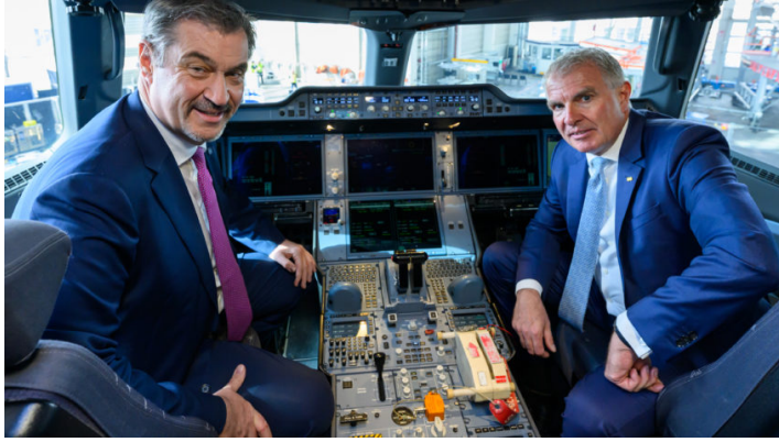
Celebration marking the “100th anniversary of Deutsche Lufthansa AG” on 23 March 2026 at Munich Airport: Minister-President Dr Markus Söder and Carsten Spohr, CEO of Deutsche Lufthansa AG, in the cockpit of an Airbus A350.