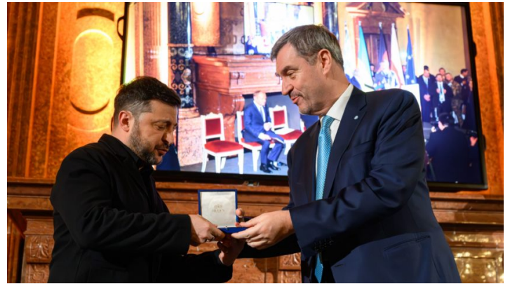
On 14 February 2026, Ukrainian President Volodymyr Zelenskyy accepted the Ewald von Kleist Prize from Prime Minister Dr Markus Söder on behalf of the Ukrainian people.