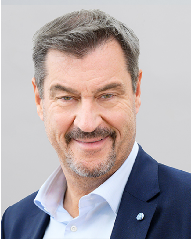
Portrait: Dr. Markus Söder, MdL

Born on 5 January 1967 in Nuremberg, married, four children