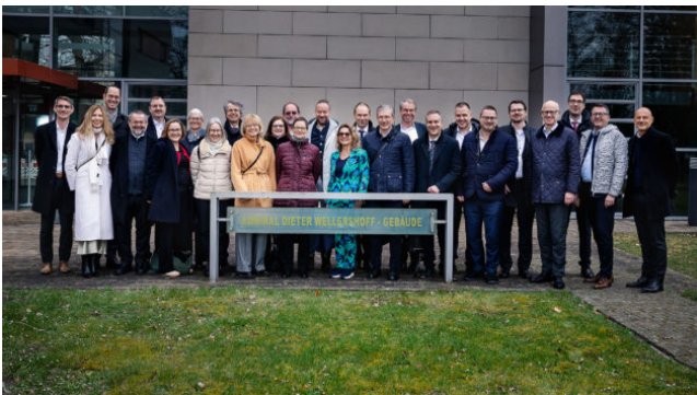
TOP Management Programme at the German Armed Forces Command and Staff College in Hamburg.

Duration: four two-and-a-half-day seminars over a period of one-and-a-half years