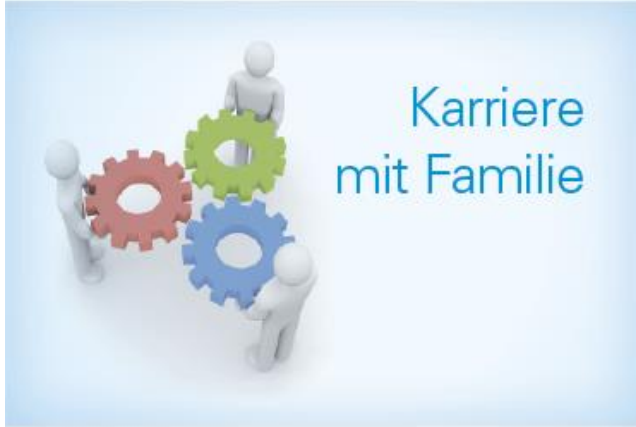
Logo Mentoring Programme

The Familienpakt Bayern (Bavarian Family Agreement), from the Bavarian State Government signals the improvements to come in balancing work and family life. Its aim is to adapt the world of work to changing life and family models. The „Career and Family“ mentoring programme is designed to help participants build the goals from Familienpakt into their own professional lives. This should be in keeping with the modern age, tangible and effective.