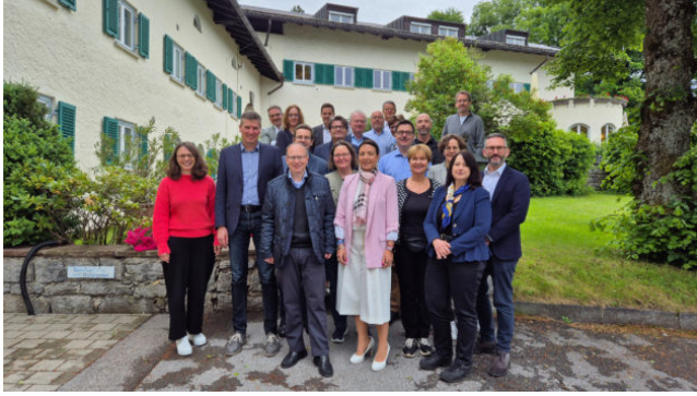
Participants of the Digital Governance Program

The part-time Digital Governance Program was specially designed for deputy heads of department at the highest Bavarian authorities. The in-service seminar series prepares participants to actively shape the digital transformation of the administration and take on management responsibility. At the same time, the program serves to build networks within the Bavarian administration and establish professional contacts beyond the state's borders.