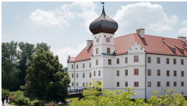
Schloss Hohenkammer.

The International Seminar is organized every two years by the Bavarian State Chancellery in cooperation with the Consulate General of the United States of America and another host country. It presents renowned speakers and deals with current cross-border topics. The aim is to promote the international competence of the Bavarian ministerial administration. The work language therefore is English.