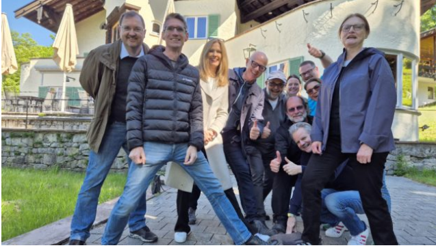
Participants of the TOP Management Programme

In offering the TOP Management Program , the Bavarian State Government seeks to raise awareness of social, economic and political developments among its top public administration leadership staff. This is achieved through a range of seminars and fact-finding missions. Specifically, participants should build their leadership competence.