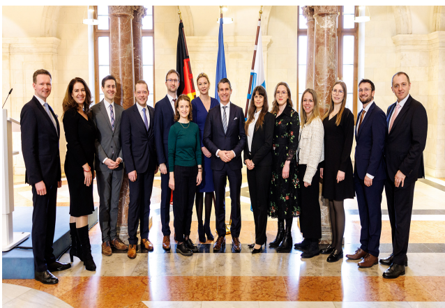
Participants of the VII European Excellence Programme

The European Excellence Programme helps managers in public administration to become versatile European experts. It allows them to expand their specialist knowledge and their language skills.